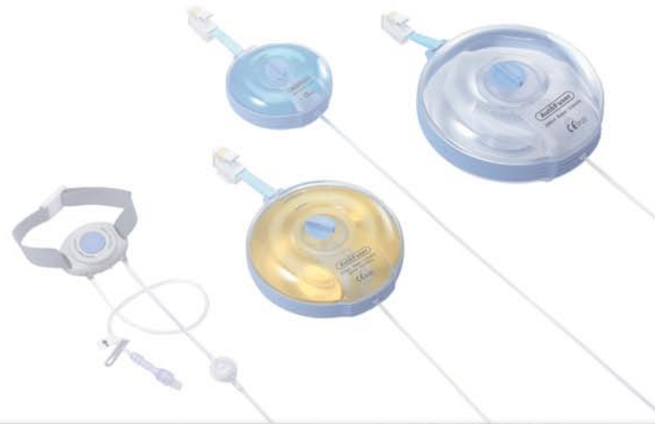
Disposable Silicone Balloon Infuser